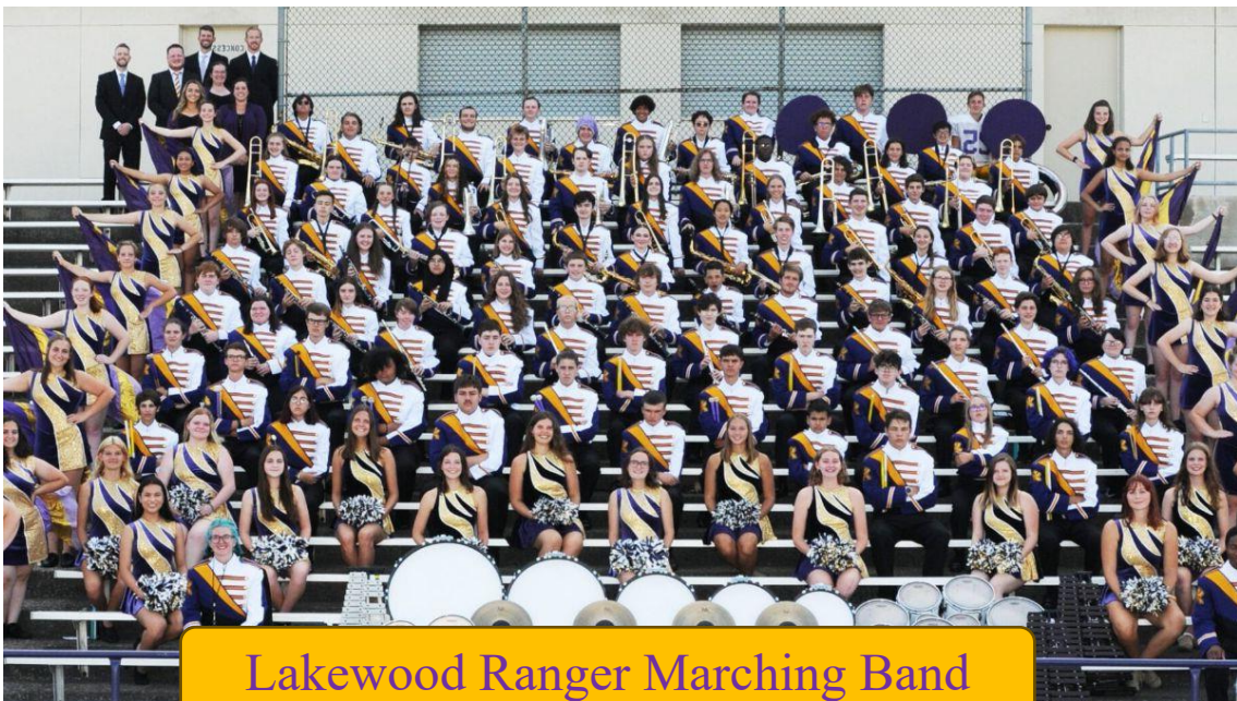
Lakewood Ranger Marching Band