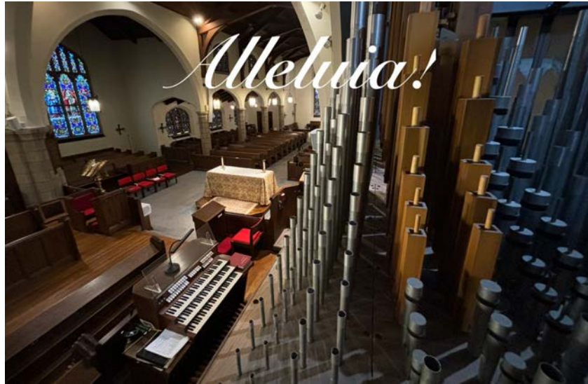
Organ Photo: Jon Tabar/Design: Dave Tabar