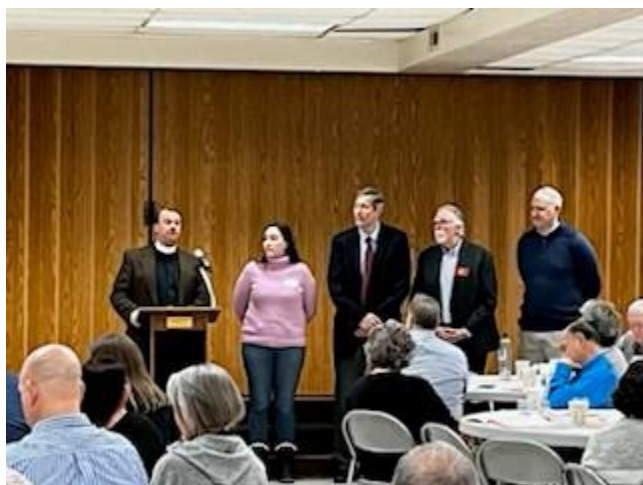
Vestry Class of 2027